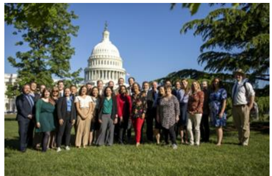
Land trust representatives from across the country gather in front of the nation's capitol to advocate for conservation.

Sustained advocacy is essential to building support for the programs and funding that help us to undertake this important work. TLTC will continue to advocate at the state and federal level, alongside our members, to further important land conservation policy.