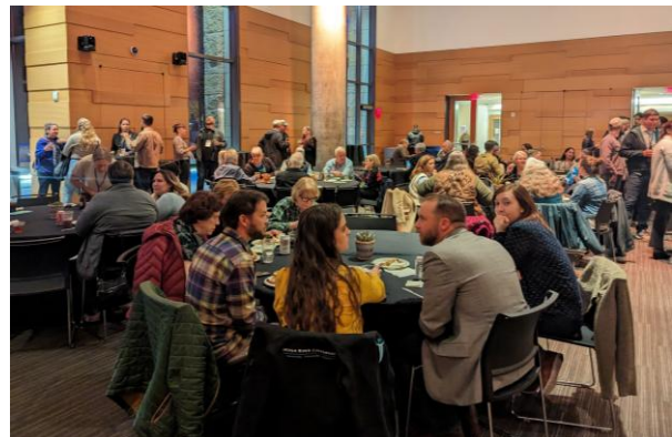
Attendees enjoying our Networking Dinner at the annual Texas Land Conservation Conference.