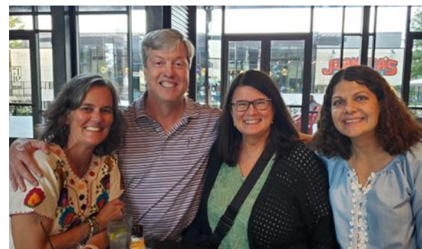
Land trust executive directors at our annual Texas Land Trust Assembly leadership summit.