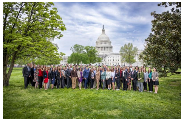
Land trust representatives in Washington, D.C. last spring for our annual Land Trust Alliance Advocacy Days.