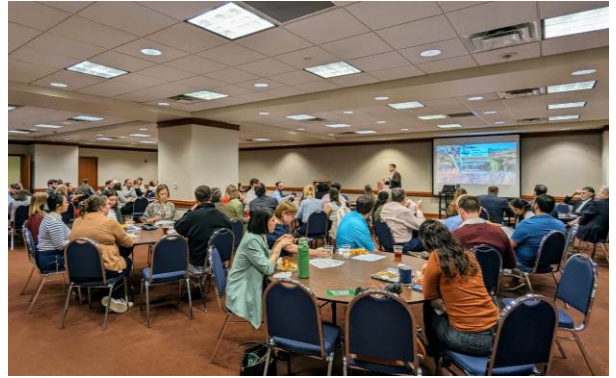
Legislative staffers enjoying enchiladas and learning about conservation programs at our Lunch & Learn event at the Texas Capitol.

TLTC works to engage our state legislators about the tools used to accomplish conservation and the success of the state's Texas Farm and Ranch Lands Conservation Program. In January, we hosted a Lunch & Learn for capitol staff to educate them about this important program that has helped to conserve over 47,000 acres across Texas, in partnership with land trusts and private landowners. The TFRLCP has leveraged each state dollar spent 9:1 and provided $23 worth of land value conserved for every $1 invested in the program. But with over 60% of applications to this program going unfunded, additional state appropriations are needed to better meet landowner demand.