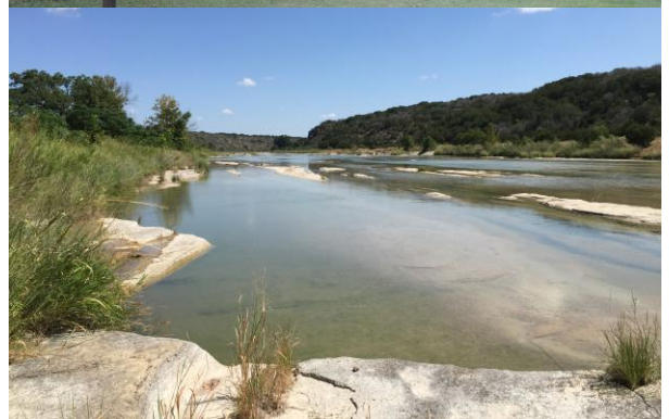
Scenes from three of the permanently preserved conservation projects funded with our Transaction Matching Grant Program.

TLTC funded six conservation easement projects in 2024 through our Transaction Matching Grants Program. This program helps to cover legal and due diligence costs associated with recording a permanent conservation easement. This year we awarded $30,000 in funding toward conservation easement projects to several land trust organizations- preserving beautiful grassland ranches, wetlands, rivers, and forests- that permanently conserved 1,850 acres, valued at more than $9.5 million. Working in partnership with land trusts and landowners across the state, these lands are now forever preserved to enhance water resources and wildlife habitat, provide places for outdoor recreation, and preserve our agricultural heritage.